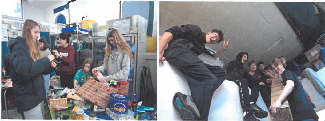
Student volunteers from King Alfreds helped decorating Euston food bank for XMAS but also brought along donations. Great kids... Thank you guys!!!

There has been a consistent increase in the number of people visiting the food bank in the last six months. In total, 4,069 have been fed by Euston food bank within this time period. 810 are children and 3,259 are adults. As we continue to receive tons of food and essential items from our partners, we do experience a