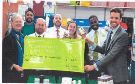
Waitrose supermarket sponsored bike ride in September 2019. Amount of money raised by the Waitrose bike ride £1,645.

Volunteering comes from being kindhearted and wanting to make a difference by helping others within your community. It is therefore imperative that we commend and say THANK YOU to all those taking time off their busy schedules to lend a hand in helping us in many ways than one to support the needy. Your efforts are worth their weight in gold, giving your precious time, kindness, diligent hard work and talents without any competition. A good example is the Waitrose bikes ride in September this year, which raised £1,645 for the Euston food bank. The Euston